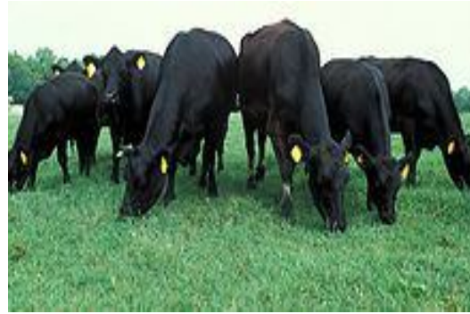
Angus cattle grazing

They are naturally polled (do not have horns) and solid black or red, although the udder may be white. There have always been both red and black individuals in the population, and in the USA they are regarded as two separate breeds - Red Angus and Black Angus. Black Angus is the most popular beef breed of cattle in the United States, with 324,266 animals registered in 2005.