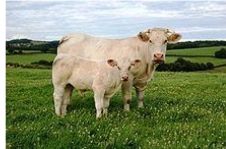
Charolais cow and calf

The breed was introduced in the southern US as early as the 1940s. It was the first popular breed after the English breeds and Brahmans. It was known to produce beef animals that had more red meat and less fat. The breed was often crossed with English breeds. Despite their relatively northerly origin, Charolais tolerate heat well, and show good weight gains on even mediocre pasturage. The coat is almost pure white. The Australian and Canadian breed standards also recognise cattle possessing a light red colour called 'Red Factor' Charolais. The term Charbray refers to the offspring of Charolais crossed with Brahms and is recognised as a breed in its own right. Charolais also can be black in colour.