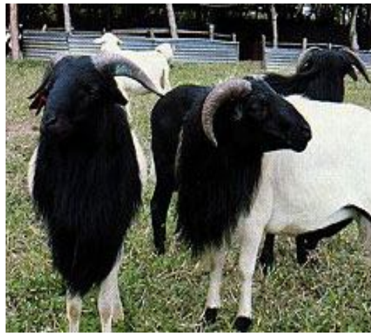
West African dwarf