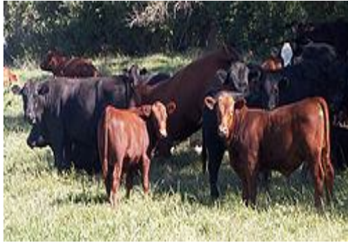
Mixed herd of Black and Red Angus

Angus cattle (Aberdeen Angus) are a Scottish breed of cattle much used in beef production. They were developed from cattle native to the counties of Aberdeenshire and Angus in Scotland, and are known as Aberdeen Angus in most parts of the world.