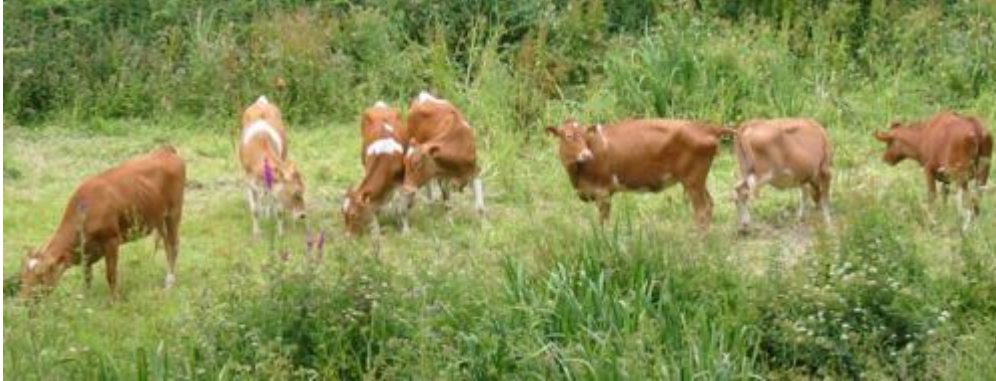
Herd of Guernsey Cattle

As its name implies, the Guernsey was bred on the British Channel Island of Guernsey. It is believed to be descended from two breeds brought over from nearby France, Isigny cattle from Normandy and the Froment du Léon from Brittany. Today the breed is well-established in Great Britain, the United States, Canada, South Africa and elsewhere.