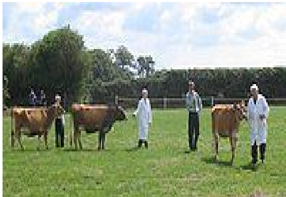
Jersey cattle being judged at a show in Jersey, home of the breed

They are calm and docile animals, but tend to be a bit more nervous than other dairy cow breeds. They are also highly recommended cows for first time owners and marginal pasture. Unfortunately, they have a greater tendency towards postparturient hypocalcaemia (or "milk fever") in dams and frail calves that require more attentive management in cold weather than other dairy breeds due to their smaller body mass and greater surface area.