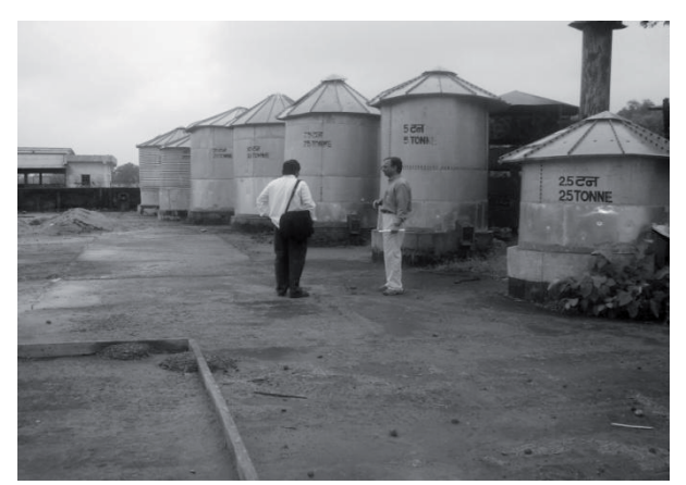
Fig. 6: Silo Storage Structures