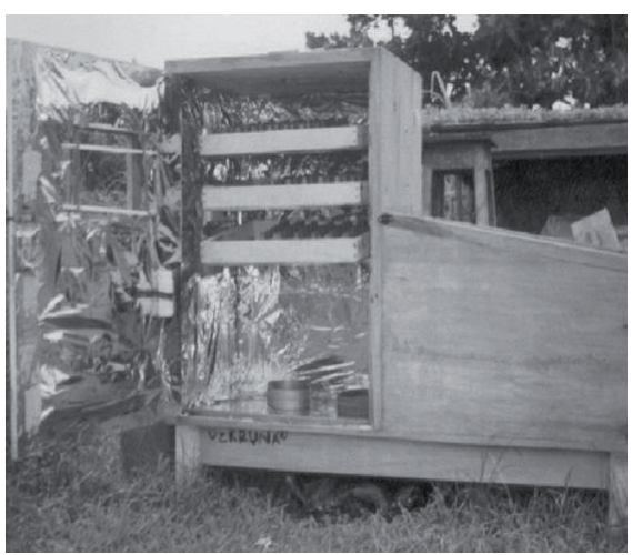
Fig. 1: Solar Incubator

India is aiming at generating 40% of its energy from bio diesel using Jatropha in the next 10 years (Mangaraj et al, 2009). Sugar cane is another major source of bio Fuel utilized in Brazil. Cars are now developed using Fuel produced from sugar cane.