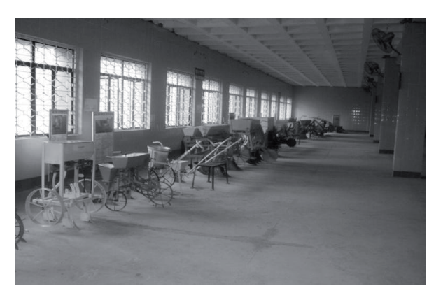
Fig. 8: Land Cultivating Machines and Planters