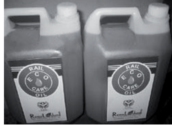
Fig. 3: Bio diesel from Jatropha