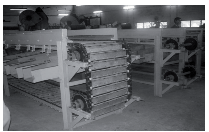
Fig. 5: Fruit Graders