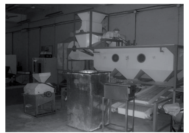
Fig. 4: Threshers and Cleaners

Agrarian nations must encourage mechanized agriculture, not by exporting agricultural machinery but by developing and manufacturing indigenous agro machinery suitable for there conditions (Adewumi, 1998a, 2000, 2004, 2005, 2007). Such nations should further graduate to become exporters of such machinery and fit into the global market. India is an example. Figs. 4 - 9 show some agricultural and food machines.