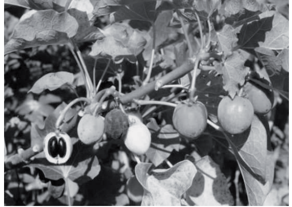
Fig. 2: Jatropha seed & Stem