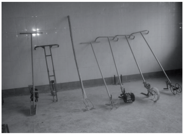
Fig. 7: Hand Operated Seed Planters