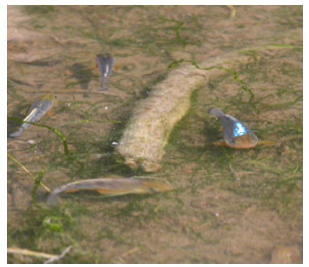
Minnows in shallow water.

Most species of nekton receive exposure to their environment both directly from the water or sediment environments and indirectly through their food. Consumers typically accumulate any <u>contaminants</u> their prey items contain, which will persist over time, leading to contaminant levels that are orders of magnitude above