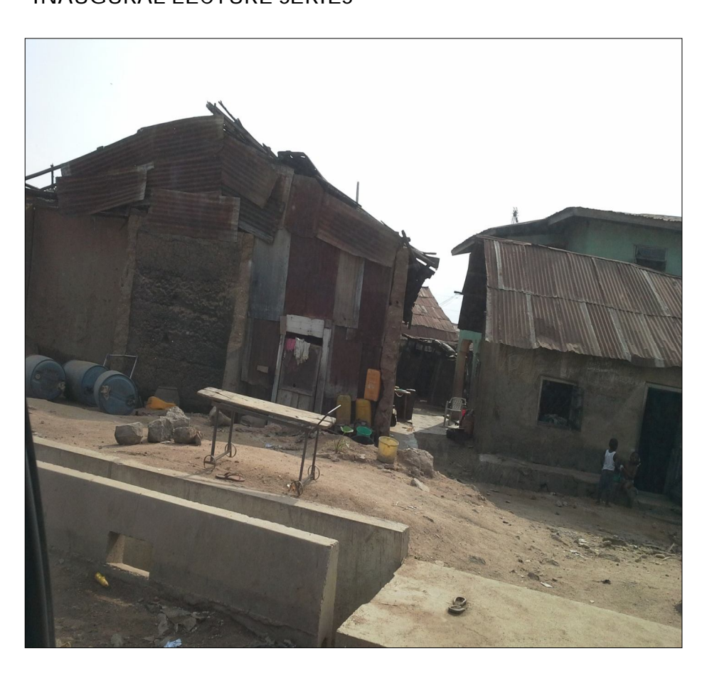
Figure 2: Dilapidated Houses In Abeokuta, Ogun State Capital, July, 2014 Source: Afolami (2014).