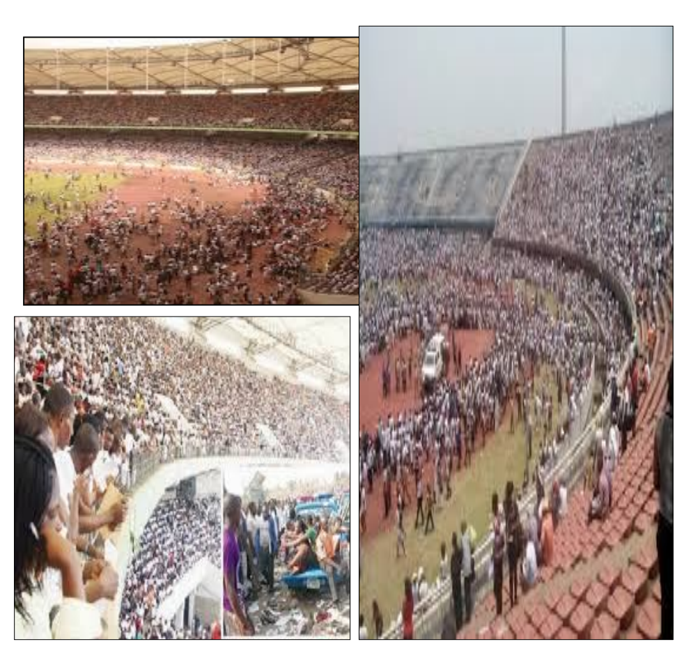
Figure 1: Nigeria Immigration Service Staff Recruitment Exercise, March 15, 2014