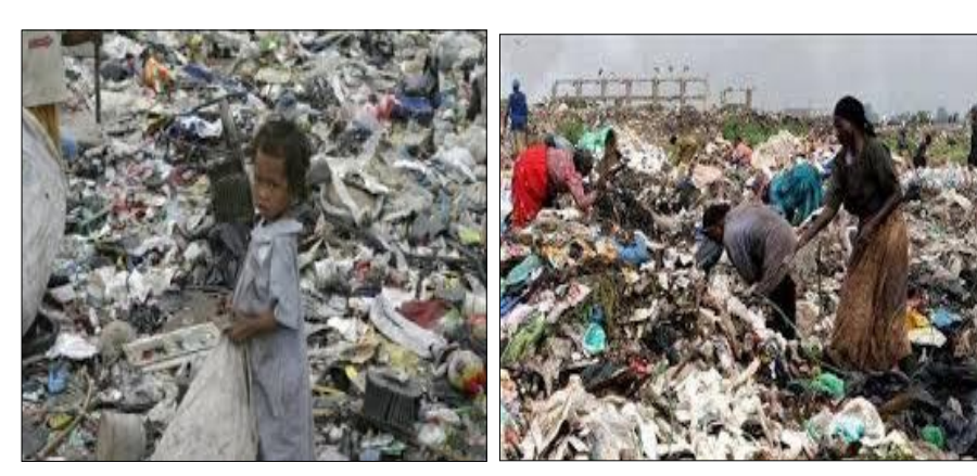
Figure 3: Heaps of Refuse with Scavengers Source: www.craftcyclemixedmedia.us Reuters Nigeria dump.

The wide spread poverty in all facets of our lives has been the greatest challenge of our time. The incidences of poverty and food insecurity have devastated many developing countries and a lot of resources are being channeled towards programmes aimed at eradicating them, (Sisay, 2012). We therefore have a responsibility to bequeath on human beings a life free of deprivations, caused by poverty. Although poverty will always be a human reality, grinding squalor and deprivations caused by greed, inhumanity of man to man and insensitivity of rulers to the needs of fellow human beings can be avoided. The topic "Multidimensional Poverty Alleviation and National Development: The Inseparable Siamese Twins" is thus a germane issue for discussion at this point in time.