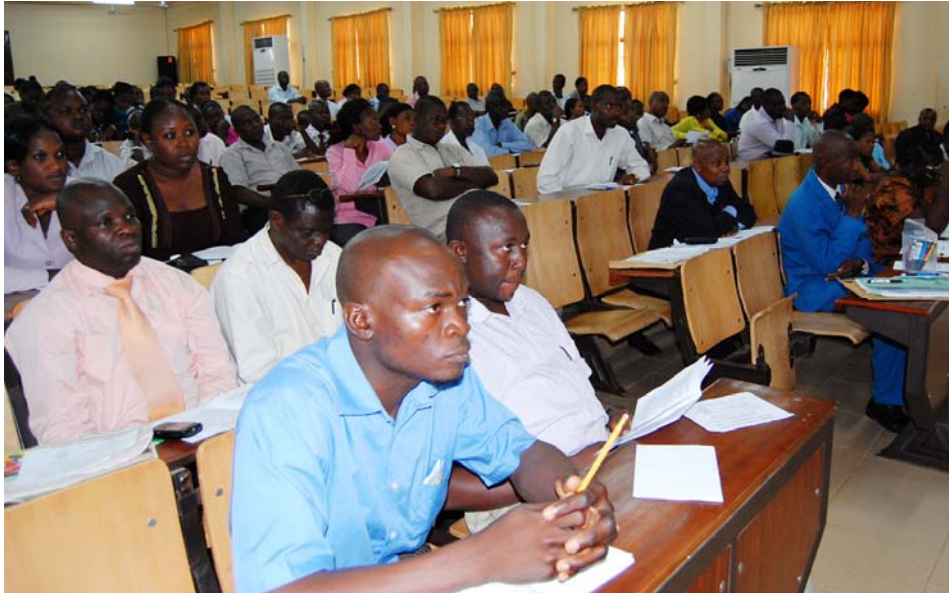
A cross-section of new staff listening with rapt attention at the lecture