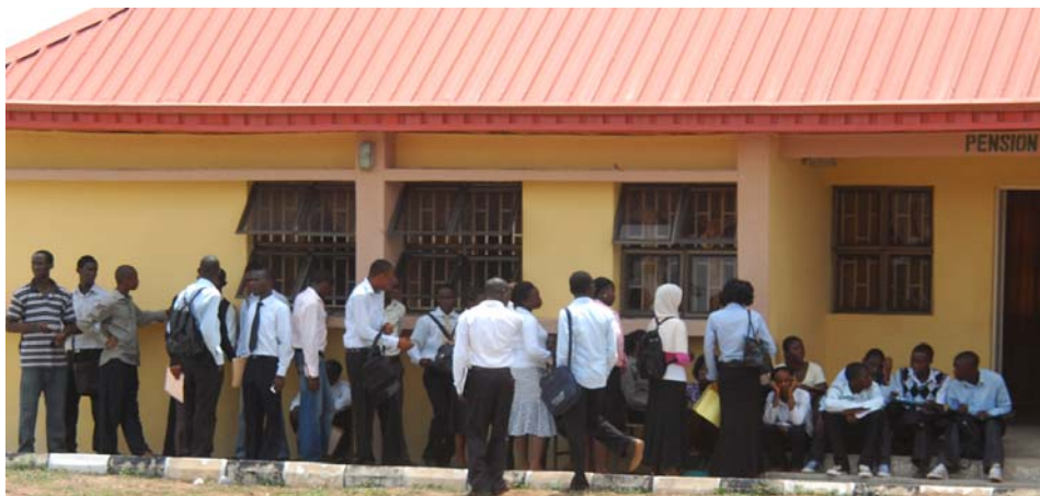
Some candidates awaiting screening at one of the Centres.

Some of the candidates, who spoke to UNAAB BULLETIN crew, described the exercise as transparent and orderly. It was observed that some of the candidates were turned back for improper dressing and other irregularities.