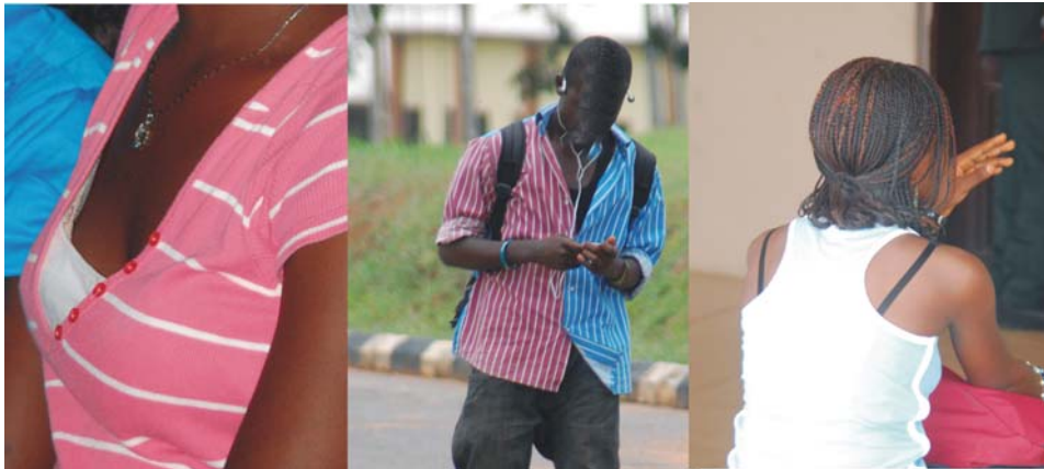
Symbols of indecent dressing