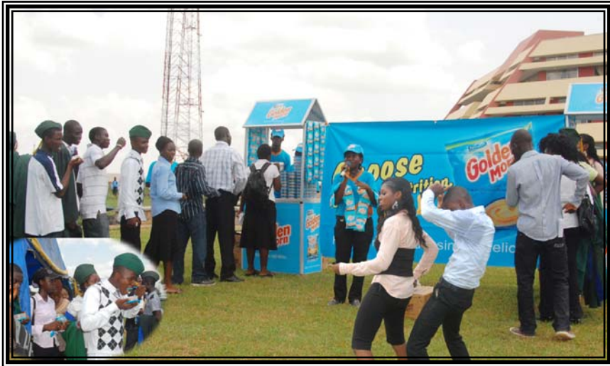
..Awwuf: Matriculants waiting for their turn at the Golden Morn stand.