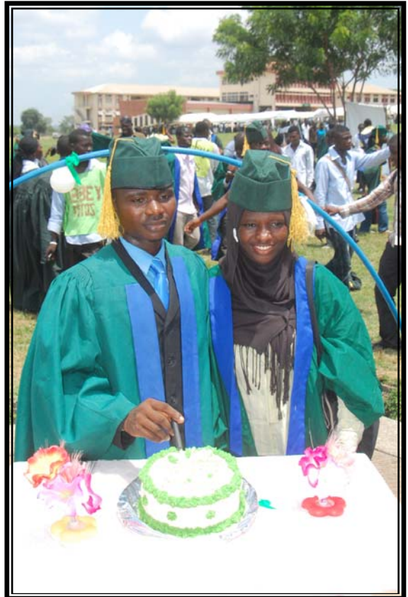
Elated matriculants cutting ceremonial cake