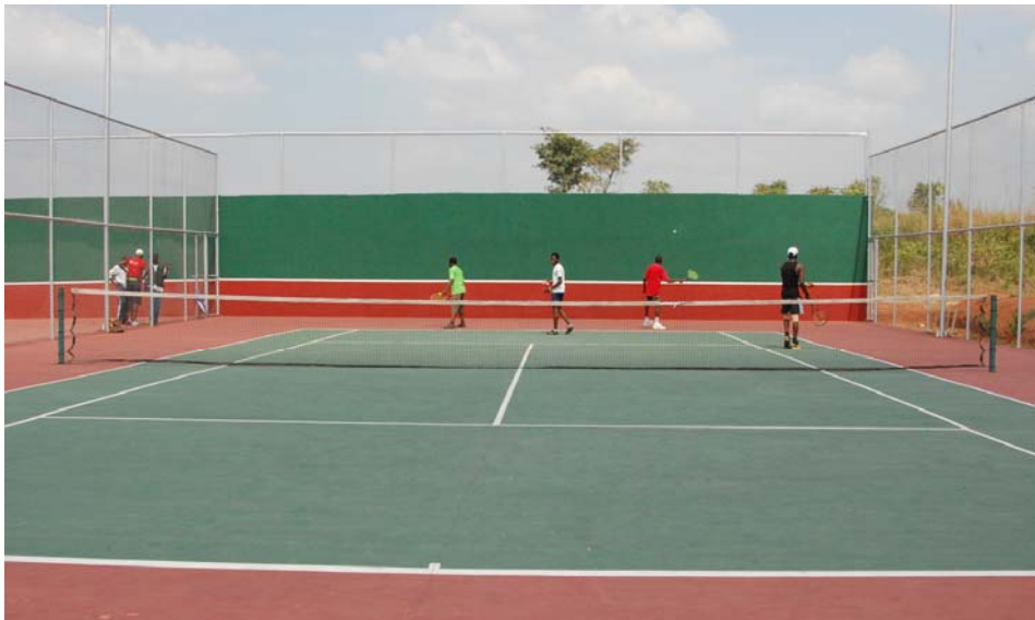
Tennis Court: One of the facilities at the UNAAB's Sports Complex

Others are, The Bells University of Technology, Ota, Redeemers University, Mowe, Tai Solarin University of Education TASUED, Olabisi Onabanjo University, Ago-Iwoye and Babcock University, Ilisan.