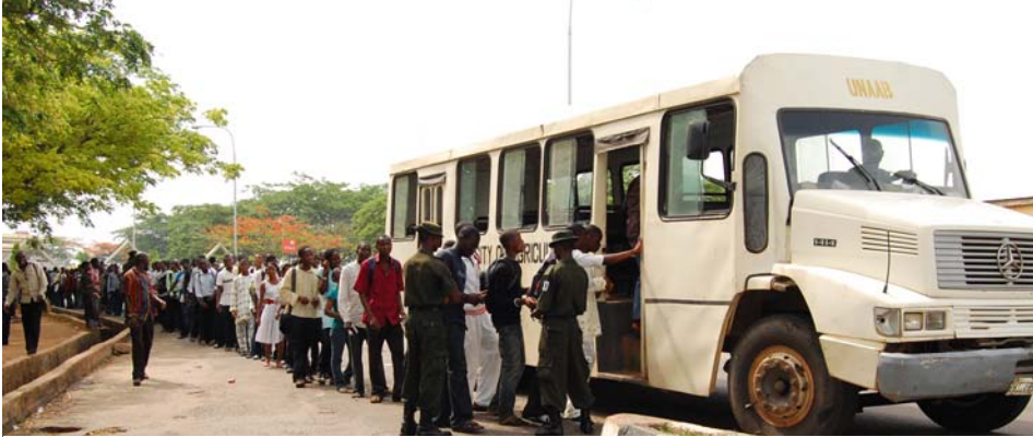
One of the buses in MANCOT fleet loading Students at the peak operation on Campus.