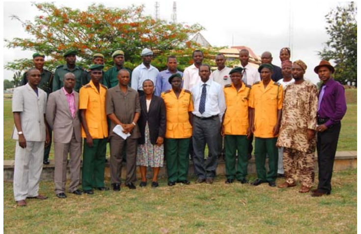
A Group Photograph of officials with the newly decorated staff