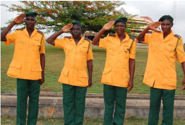
A salute of delight and appreciation by the newly decorated Environmental Officers