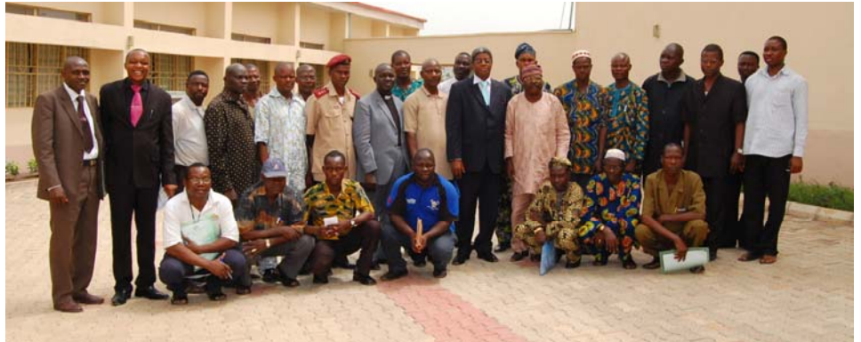
Drivers, Mechanics and Tractor Operators posed for a group photograph with top Officials of the University and Consultants, shortly after the Refresher Course