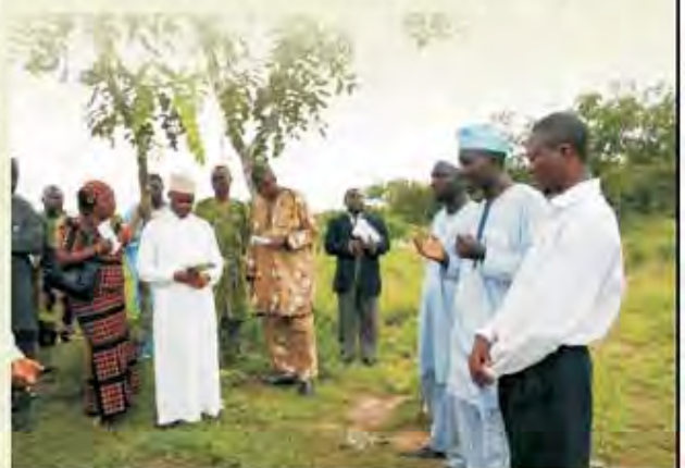
University Clerics and members of the University community at a prayer session for the smooth take-off and success of CENHURD Village