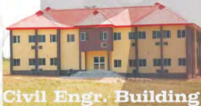
Civil Engr. Building