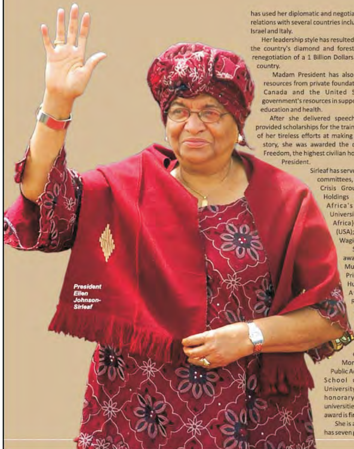
President Ellen Johnson- Sirleaf

She is a proud mother of four sons and has seven grandchildren. 🍎