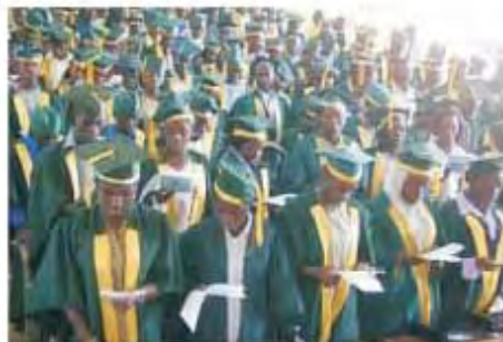
A cross-section of graduands