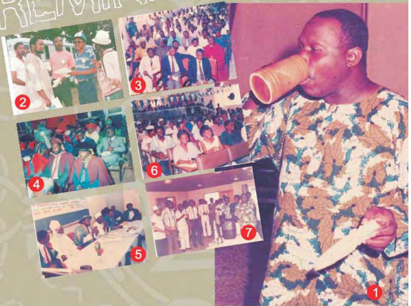
1. No controversy. Three time nation helmsman, Chief Olusegun Obasanjo is an exemplary African man even as he gushed down parboiled corn with fresh palmy (oguro) when the university management paid him a courtesy visit