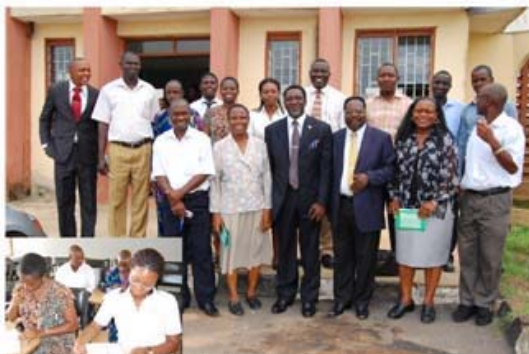
(Inset) ...Participants at the Workshop and group photograph of top officers of the University and Trainees.

He described the practice of organic agriculture as the most-assuring