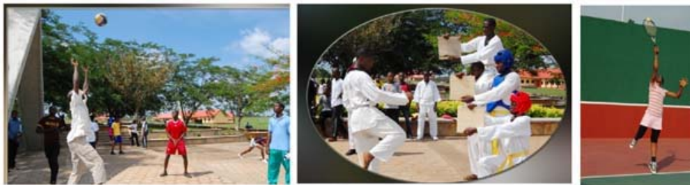
UNAAB Athletes in action

According to a release from the University's Sports Coach,