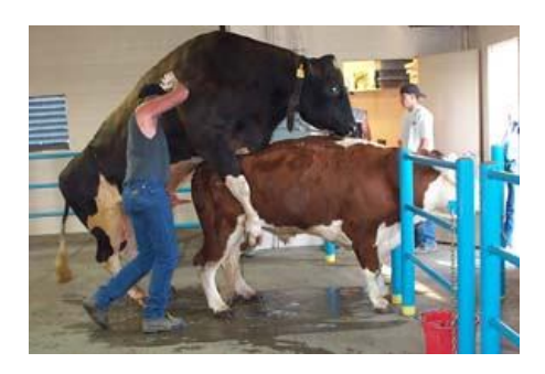
A: Faulse mounting