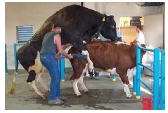
C: Diversion of penis into AV