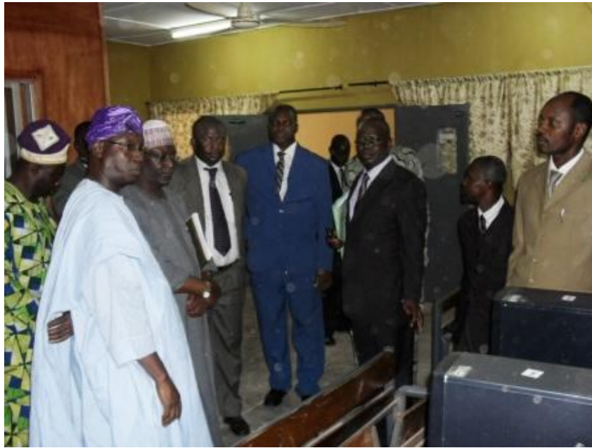
Plate 7: Advisory Group at the Central Computer Laboratory