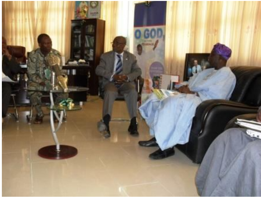
Plate 5: A relaxed discussion at the VC's office