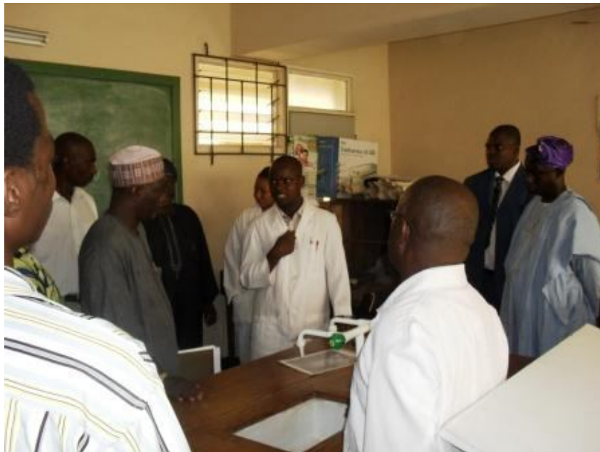
Plate 10: Visit to the Mapping room