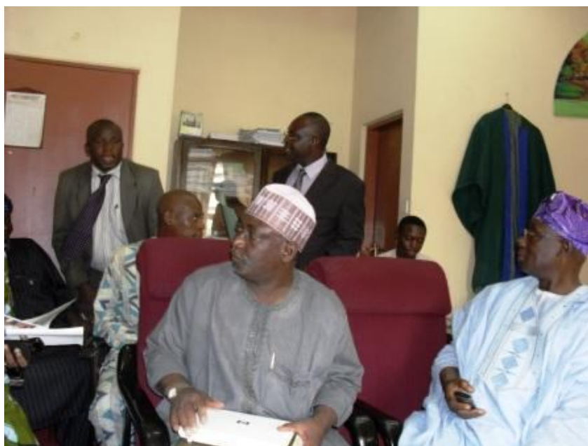
Plate 2: Introduction of scientists present