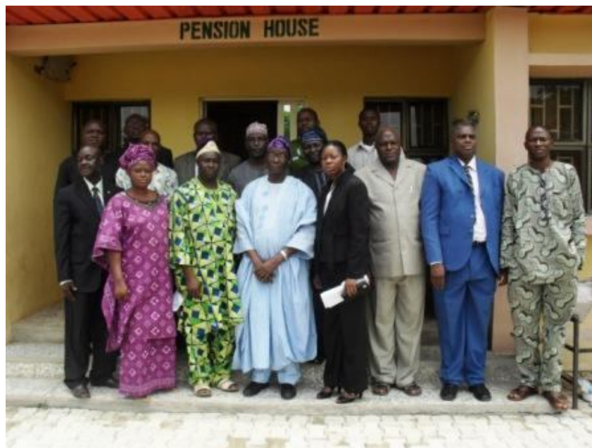
Plate 12: Group Picture at the Pension House