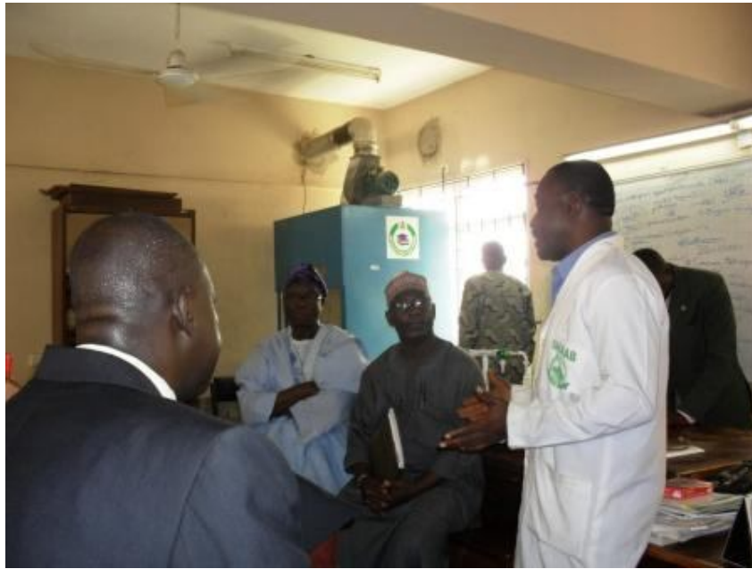
Plate 9: Visit to the Environmental Laboratory