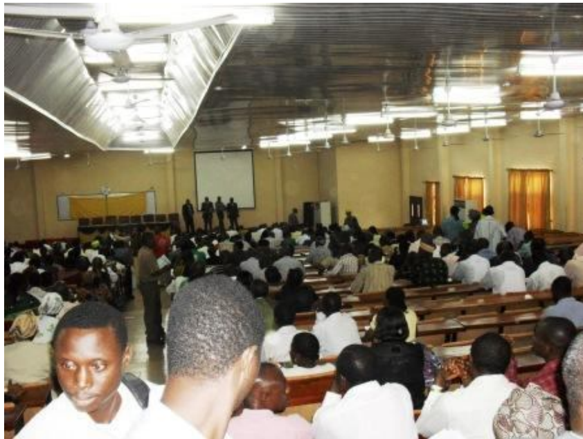
Plate 8: Visit to JAO 3