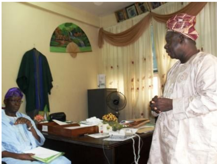
Plate 1: Group at the DVC, Development's office