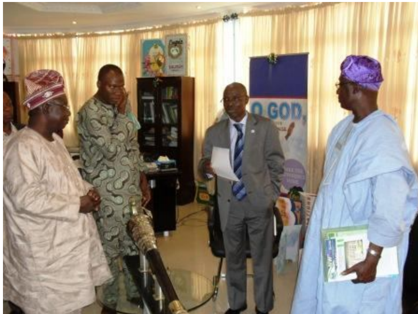
Plate 4: The VC receiving the Advisory group members