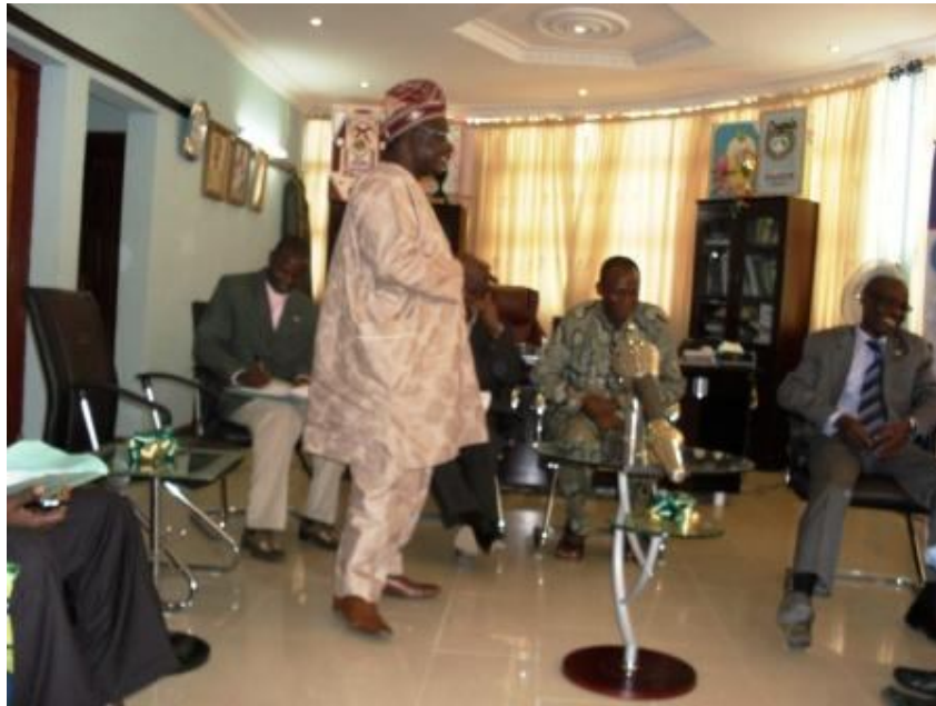
Plate 3: DVC, Development making a point at the VC's office