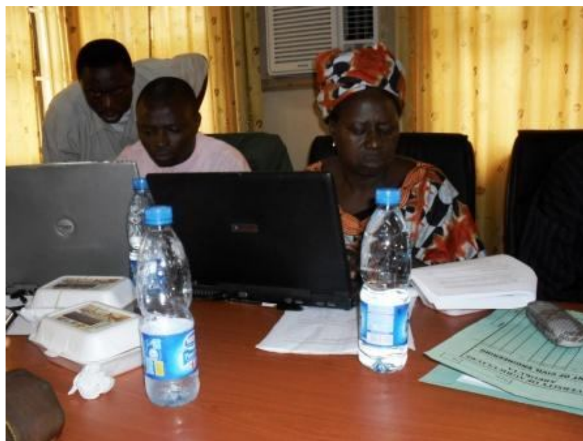
Plate 11: Secretarial duties at the MOU fine tuning