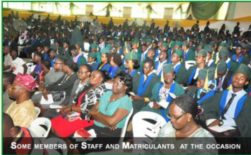
SOME MEMBERS OF STAFF AND MATRICULANTS AT THE OCCASION

The Vice-Chancellor used the occasion to recognise some high flying students for their exemplary performance in the 2014/2015 UTME admissions exercise.