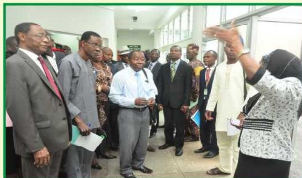
University Library's inspection by the Accreditation Team from National Universities Commission (NUC) - December, 2014