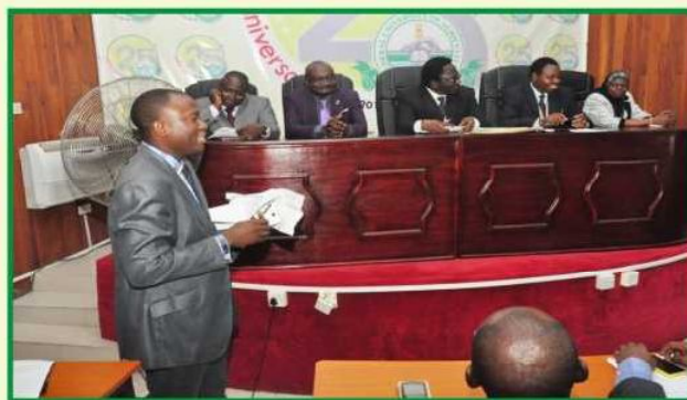
University Management's interaction with the Accreditation Team from National Universities Commission (NUC) - December, 2014