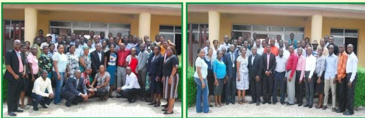
Group photograph of Facilitators and Trainees (Groups A & B) of the ADAPTI Programme 2015

The Academic Planning Unit had over the years facilitated the Digital Appreciation Programme for the academic and non-teaching staff of the University. The Digital Bridge Institute (DBI), a subsidiary of the Nigerian Communication Commission (NCC), extended its cooperation with the University by offering its Advanced Digital Appreciation Programme for Tertiary Institutions (ADAPTI) Training to one hundred and five (105) FUNAAB staff between 11th and 15th May, 2015 at the Federal University of Agriculture, Abeokuta Campus. The Training was designed to equip staff of tertiary institutions with basic ICT office productivity tools, including the intranet, internet, use of e-teaching and e-learning facilities as well as collaborations in course delivery at no cost to the participants. The overall goal of the training is to train the needed skilled manpower for the fast growing information and communication technology industry in Nigeria.