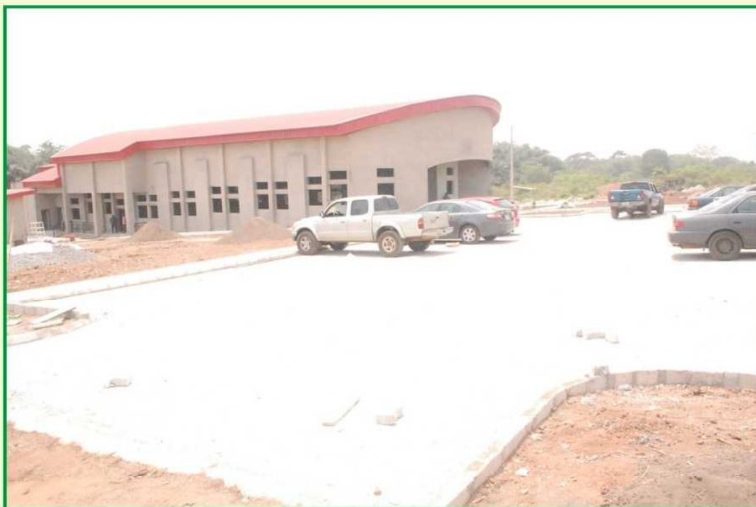
250 Seater Computer Laboratory