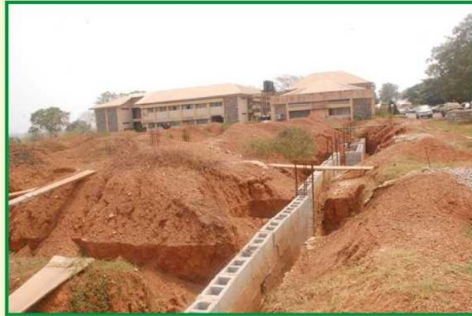
Foundation Structure for COLPLANT Phase 2