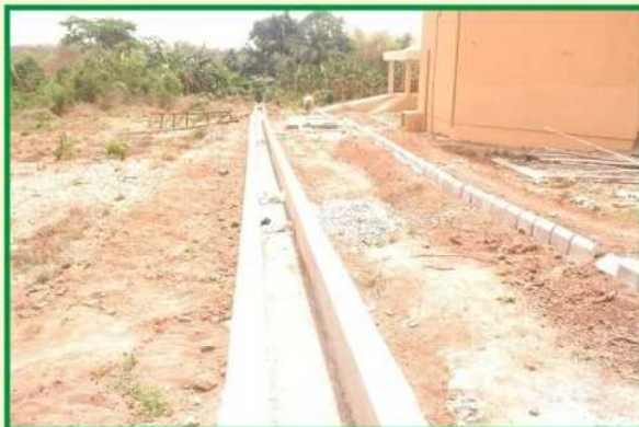
Drainage for 1000 Capacity Building