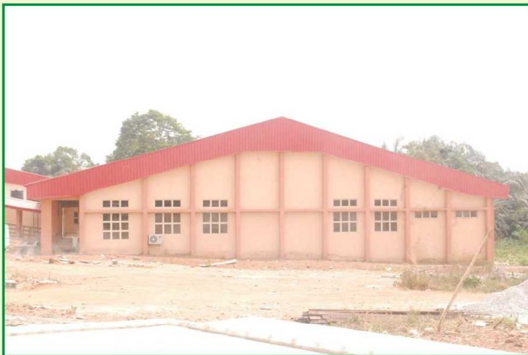
250 Chemistry Laboratory