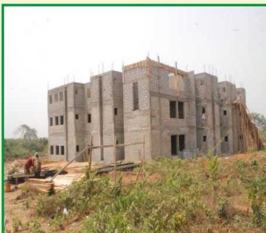
Construction of Male Hostel Block B