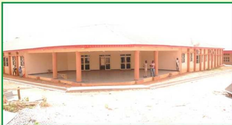
250 capacity Biology Laboratory