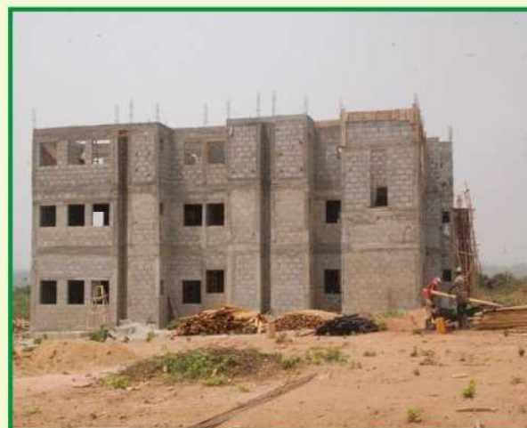
Construction of Female Hostel Block A