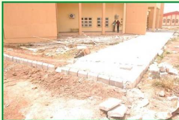
Park, and walkways for 1000 Capacity Building