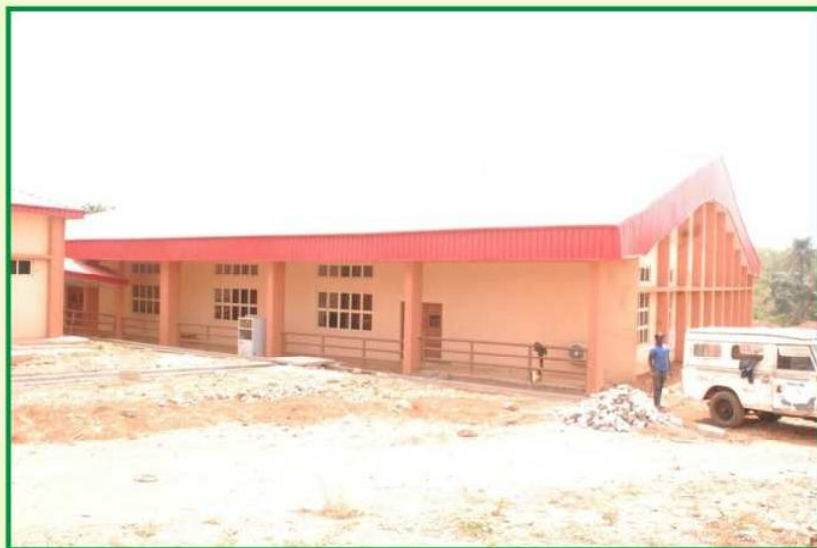
250 Biology Laboratory