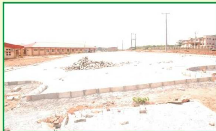
Car Park for 1000 capacity Building