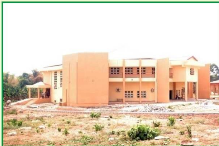
1000 Seater Capacity Building Lecture Theatre