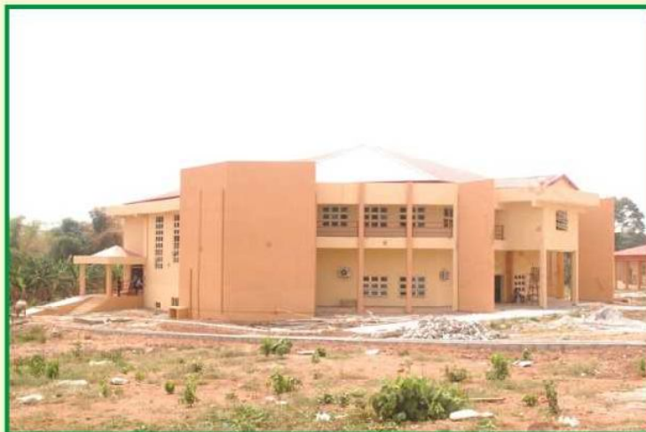
1000 Seater Capacity Building Lecture Theatre