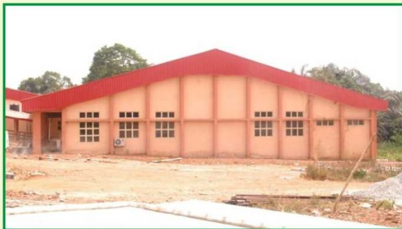
250 Biology Laboratory