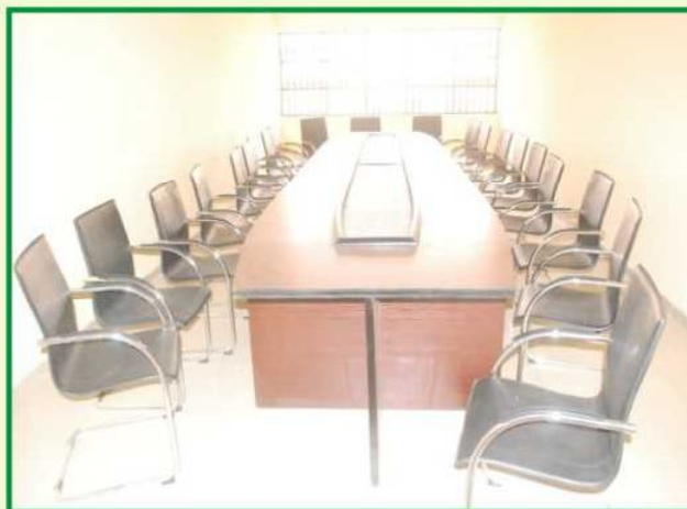
Supply and Installation of Furniture and Fittings for Entrepreneurship Building