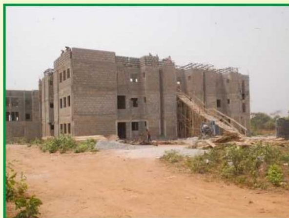
Construction of Male Hostel Block A