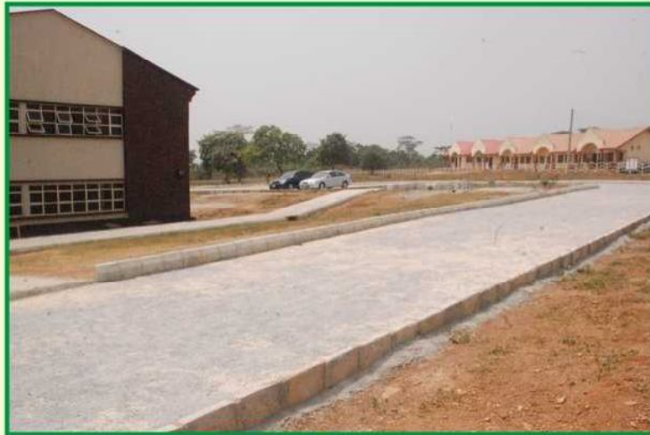
Park and Walkways for Entrepreneurship Building