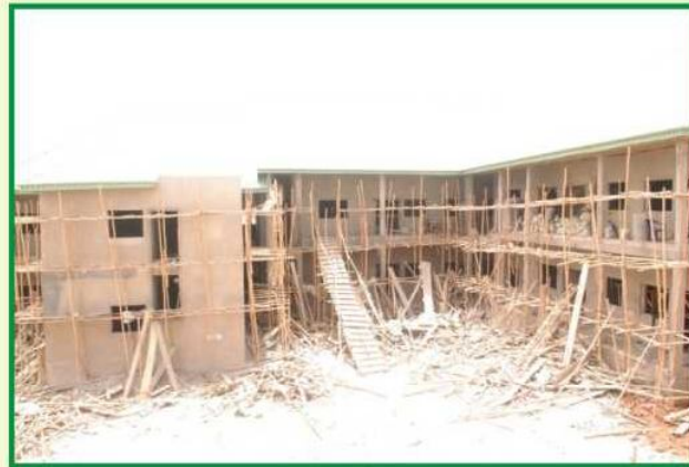
Construction of COLFHEC Phase 2