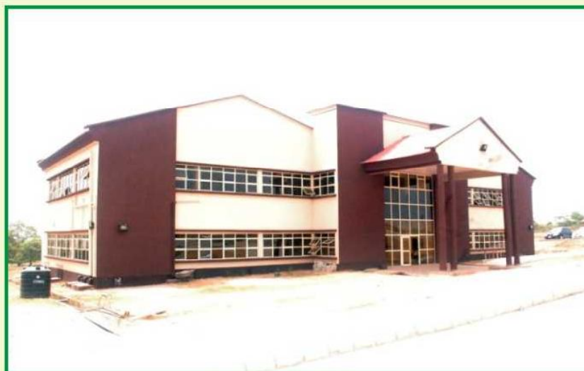
Construction of Entrepreneurship Building