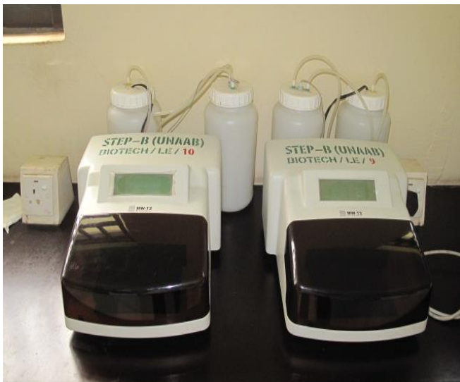
Elisa Plate Washer