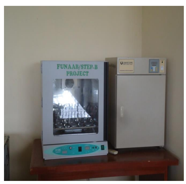
Incubator Oven with Shaker